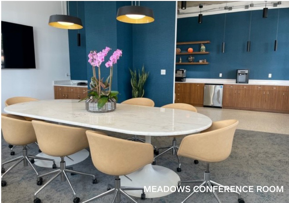
MEADOWS CONFERENCE ROOM