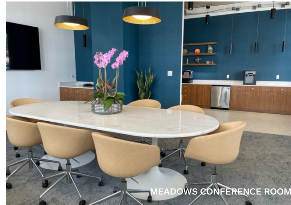
MEADOWS CONFERENCE ROOM